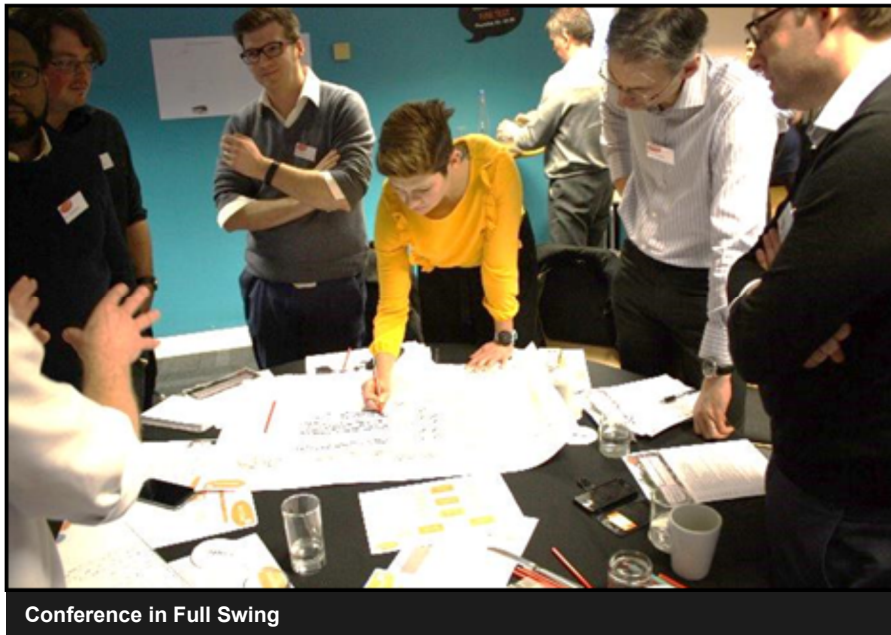
Conference in Full Swing