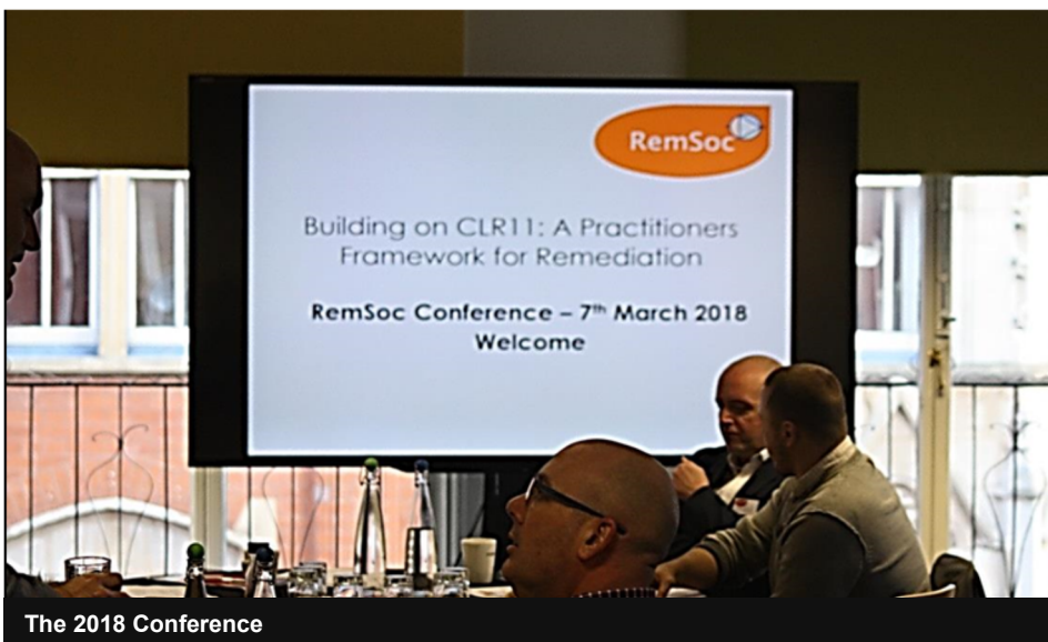
The 2018 Conference

https://www.remsoc.org/2018/03/09/gallery-2nd-remsoc-conference-7th-march-2018/